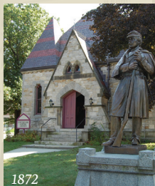
EDGE LLL MEMORIAL LIBRARY